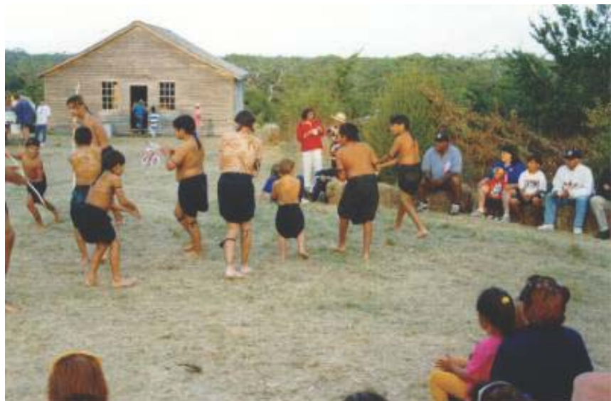
Lake Condah, Victoria

Lake Condah, in south-western Australia, is the traditional country of the Kerrup-Jmara people of the Gundtjijmara nation. The lake was created by volcanic lava flows around 10,000 years ago - that is, within cultural memory. The lake was a rich resource, and the installation of stone fish traps enabled easier harvesting. In the early colonial years (1830-40s) the rugged stony country