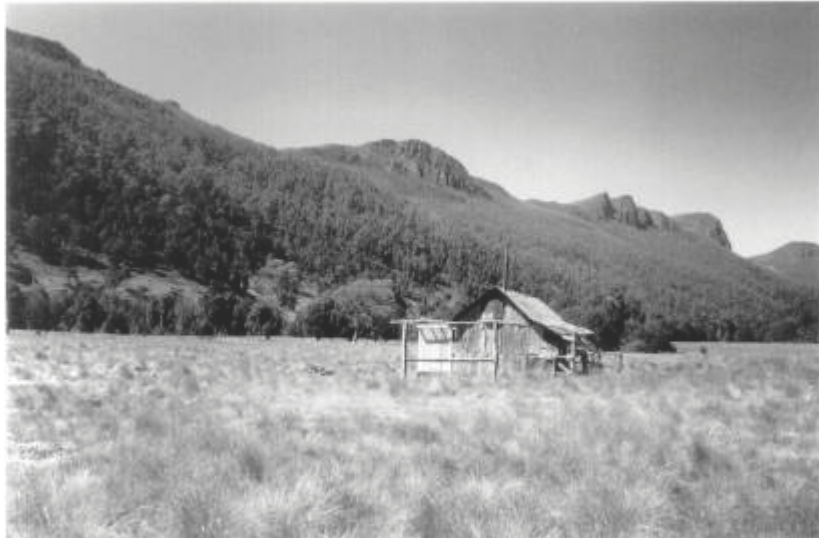
The Upper Mersey Valley

The threat of displacement from this landscape came in the form of a National Park and then a World Heritage Area declaration, based on outstanding natural values. The historical land uses were banned, as were horses and dogs, based on a desire to protect natural values. Feeling 'locked out', local people protested, and then sought a study of their connections with this place which concluded (in part):