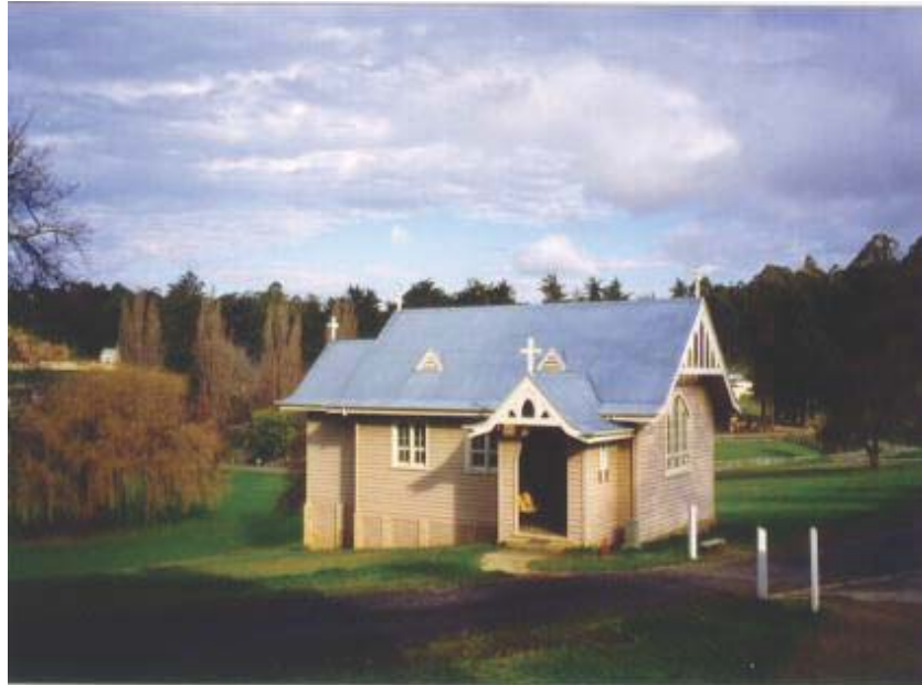
Port Arthur - the locals' church

At Mt Penang, a boy's detention centre (prison) in NSW, closure of the centre and proposed reuse of the site and buildings for festivals prompted a study of heritage values. Group discussions were arranged with those who were detained there or worked there over the years and up to the present day. Mount Penang contained indelible memories for those who had been detained there. Working with some of these men, they wanted us, the researchers, to see the barracks in which they slept, the corner of the room that was theirs so that we can understand their memories and their experiences, but when they look at the place, it is again filled with the people who were there at the time. For us as visitors, it is enriched by these men's stories, but does not have the power over us that it does over them.